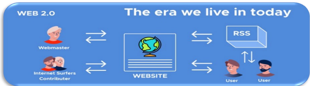
Fig 2. flitpay.com

Web 2.0, the second stage of the World Wide Web’s evolution, emerged in the early 2000s and brought about a paradigm shift in the way we use the internet. Unlike web 1.0, which focused primarily on one-way communication and static web pages, web 2.0 is characterized by a focus on user-generated content, social networking, and dynamic, interactive experiences. It has enabled the development of new business models and opportunities for innovation, and has transformed the way we connect with each other and share information online. One of the key implementations of web 2.0 is the rise of social media platforms, such as Facebook, Twitter, and Instagram. These platforms allow users to create profiles, connect with each other, and share content in real-time, creating a more dynamic and engaging online experience. Another important implementation of web 2.0 is the development of cloud computing, which enables users to access and share data and applications over the internet.