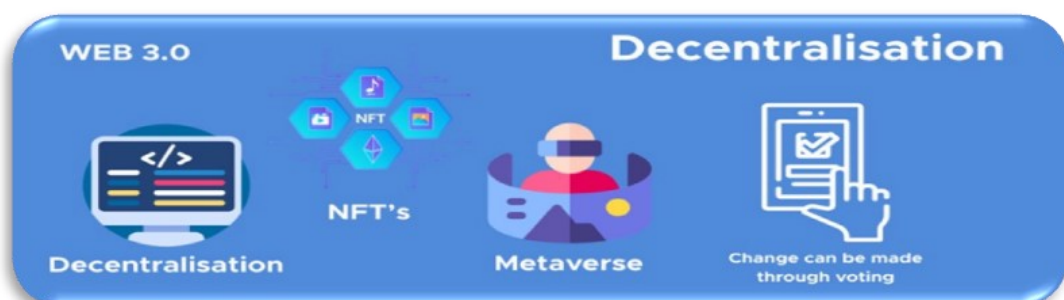
Fig 3. flitpay.com